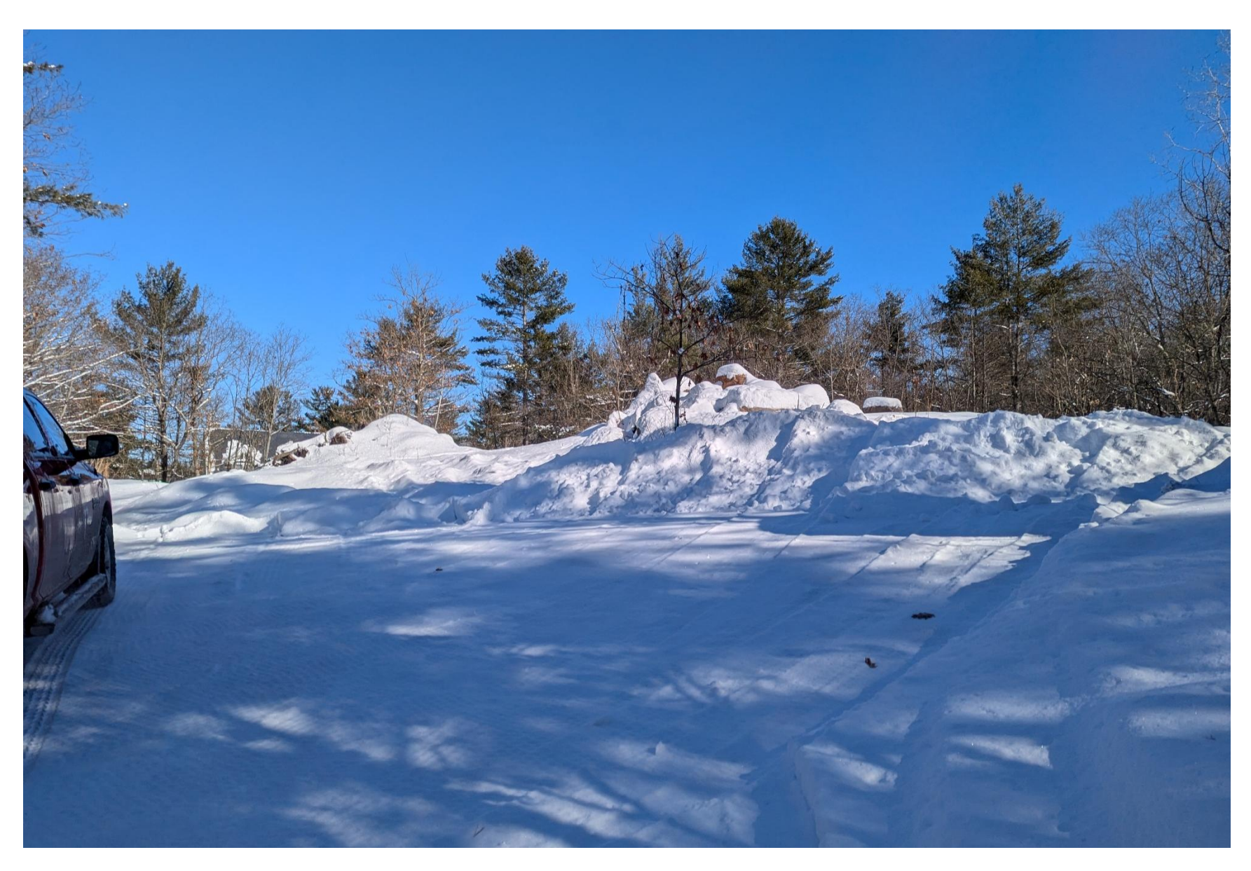
Figure 5 Rear of property from traveled right-of-way facing north.