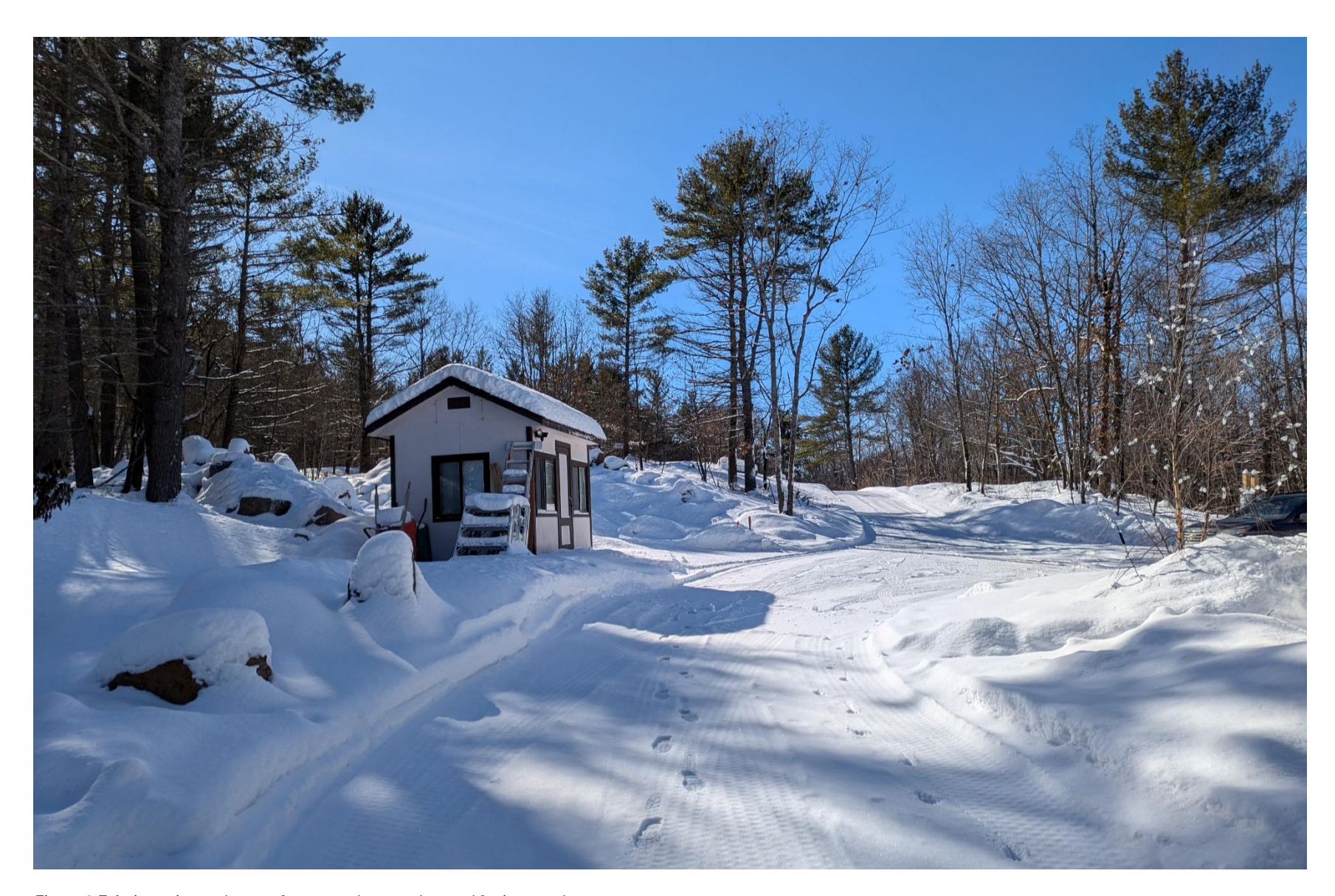
Figure 2 Existing privy and area of proposed garage beyond facing south.