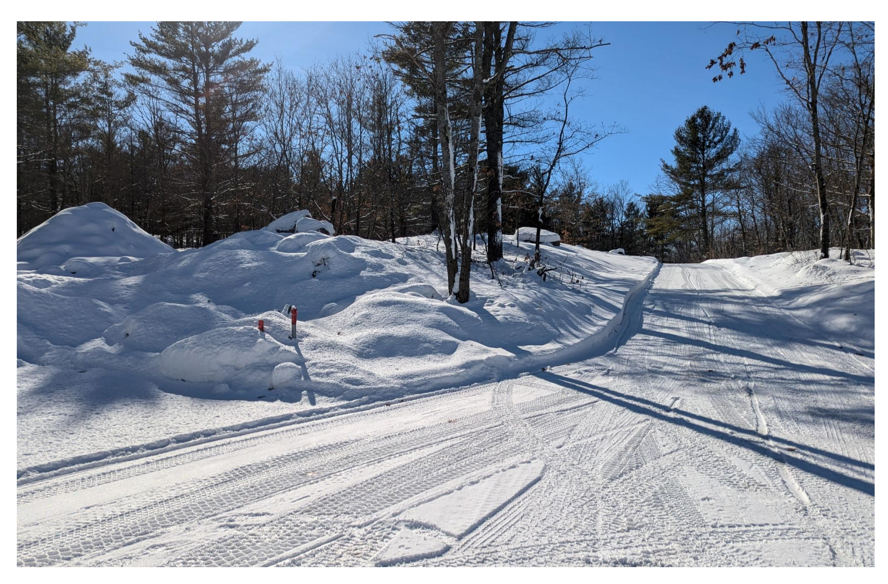
Figure 3 Area of proposed garage and vegetation in eastern side yard facing southeast.