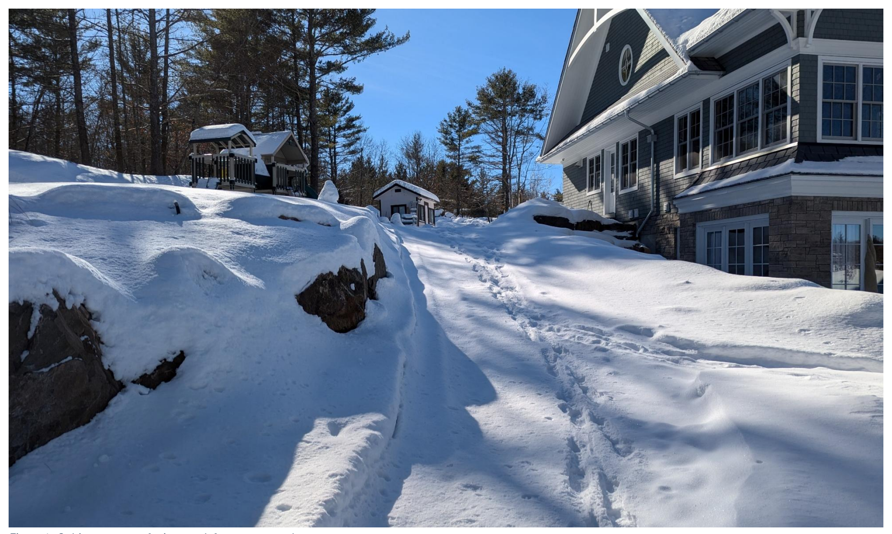
Figure 1 Subject property facing south from water yard.

Application A-22-24 (Homewood) Part of Lot 12, Concession 3, Burleigh Ward 42 Fire Route 45a Roll # 1536-020-001-32600